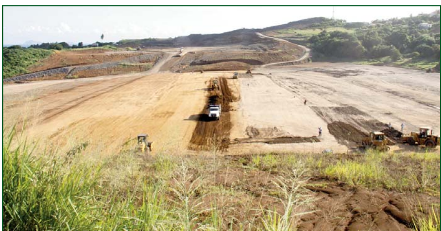
The runway begins to take shape in the 1st kilometer.