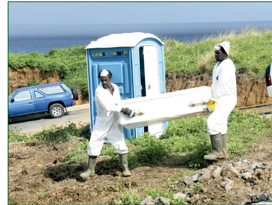
Remains being taken to the cemetery at Peruvian Vale for reburial.