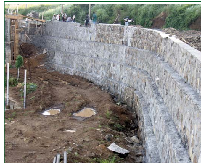
A virtually complete retaining wall at Harmony Hall.