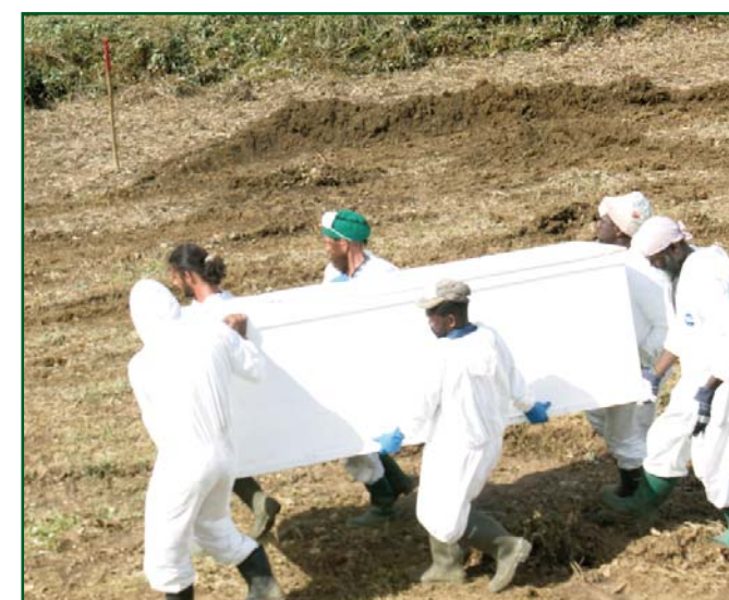
Remains being taken to the cemetery at Peruvian Vale for reburial.