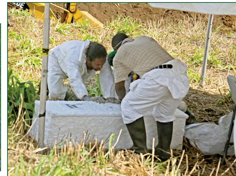
Remains being placed in coffin for reburial.