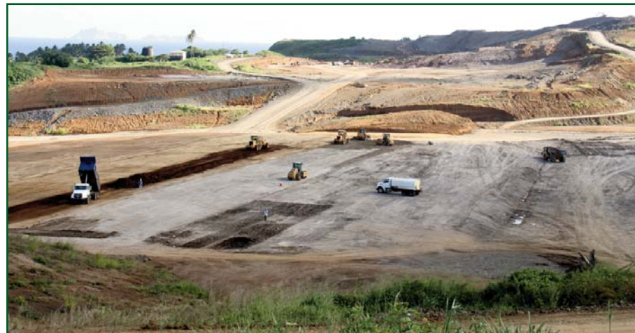
Earthworks continue to progress in the 1st kilometer.