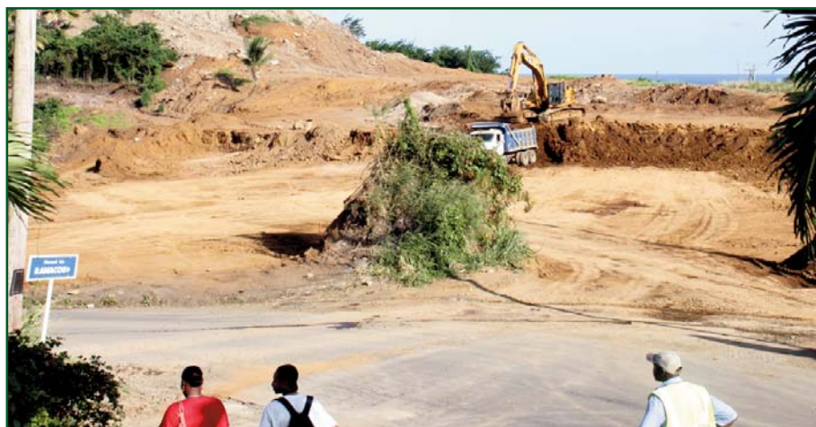
Earthworks extend into the 2nd kilometer.