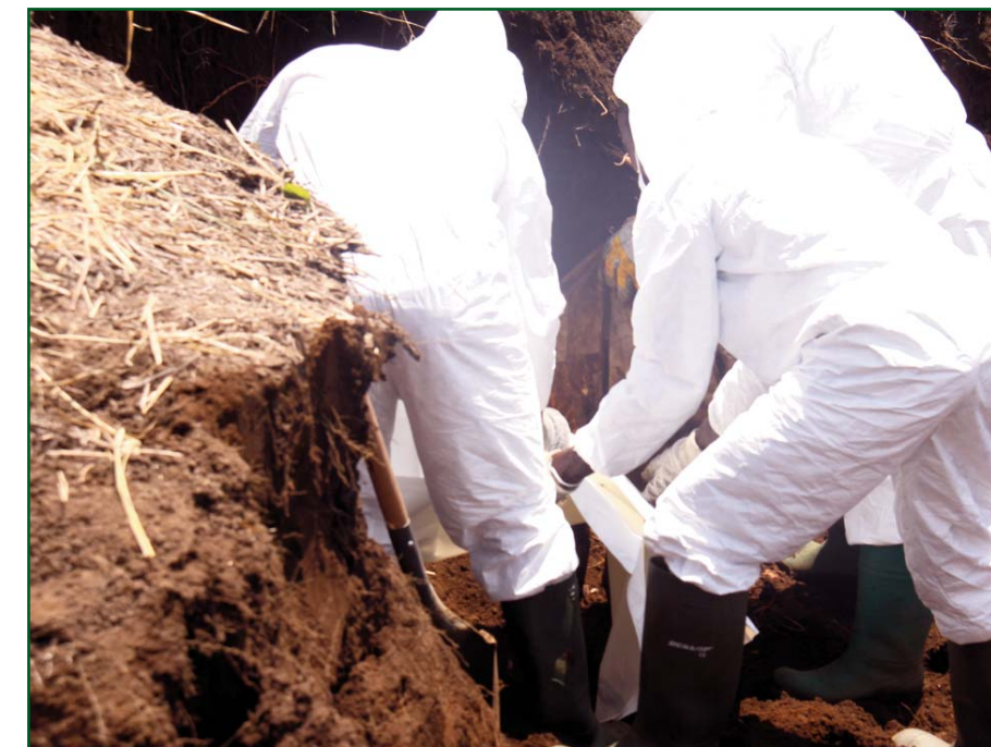
Remains being removed from the Argyle Cemetery.