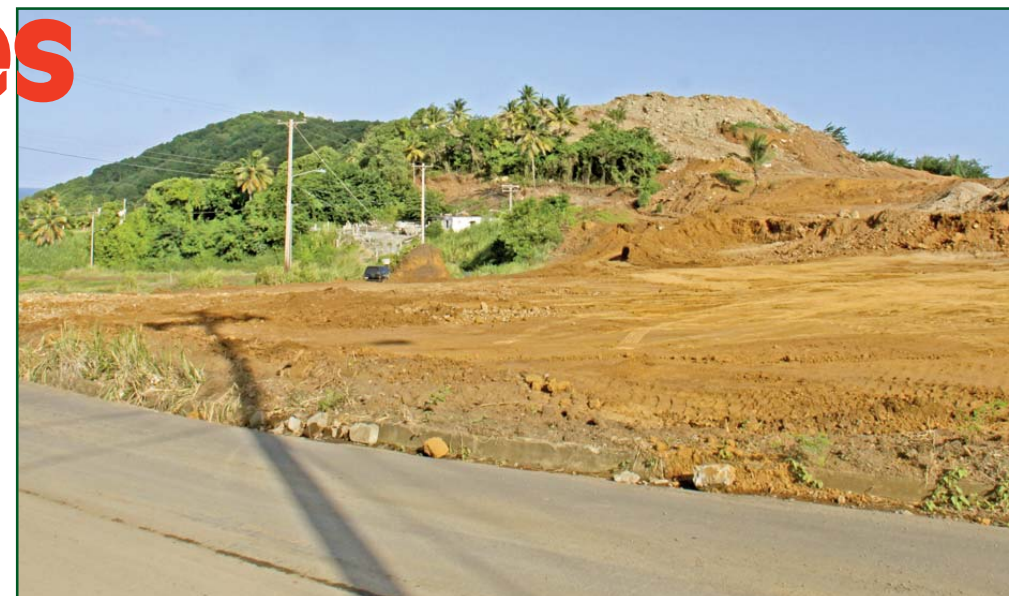
Johnson Hill being removed in the 2nd kilometer.

the construction of a retaining wall to ensure the stability of the top road in its Harmony Hall development. The contract for this work was awarded to Wilo Construction. The construction of the wall is complete, and attention is now being turned to the repairing of the road.