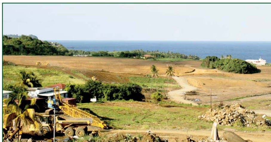
Clearing and demolition in the 2nd kilometer, including the area earmarked for the Terminal Building.