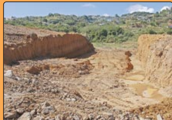
Trenches being dug in the 1st kilometer for the installation of box culverts