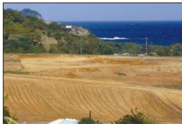
Topsoil being removed in the 2nd kilometer