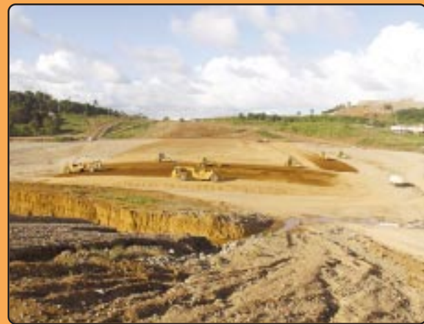
The 1st kilometer of the runway as it looked in November