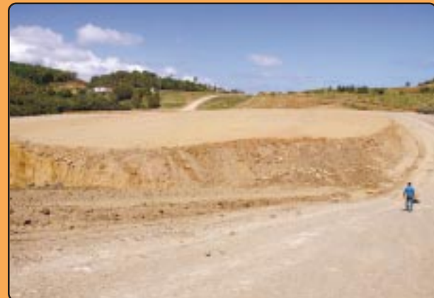
Embankment being constructed in the 1st Kilometer (December)