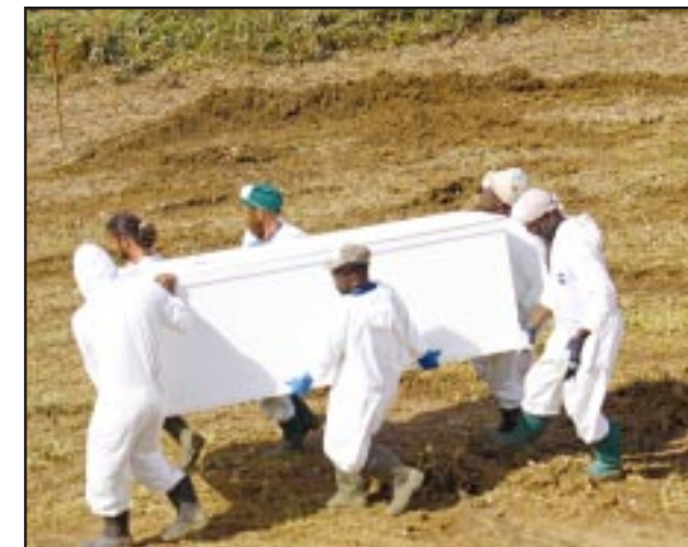
Remains being transferred to the new resting place in Peruvian Vale (September)