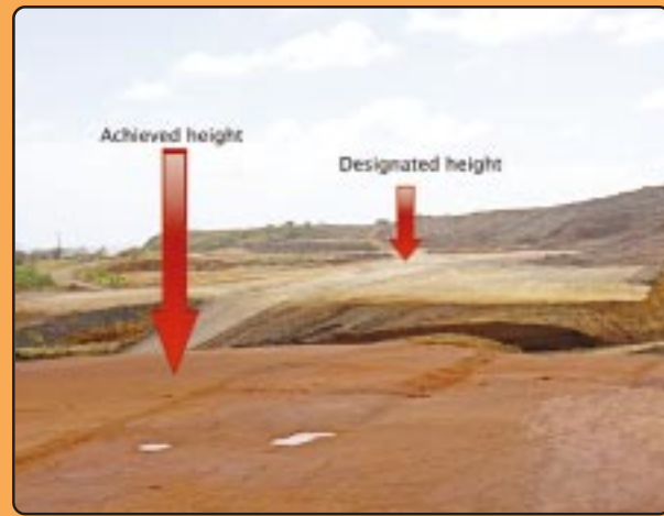
The runway nearing its required height in the 1st kilometer