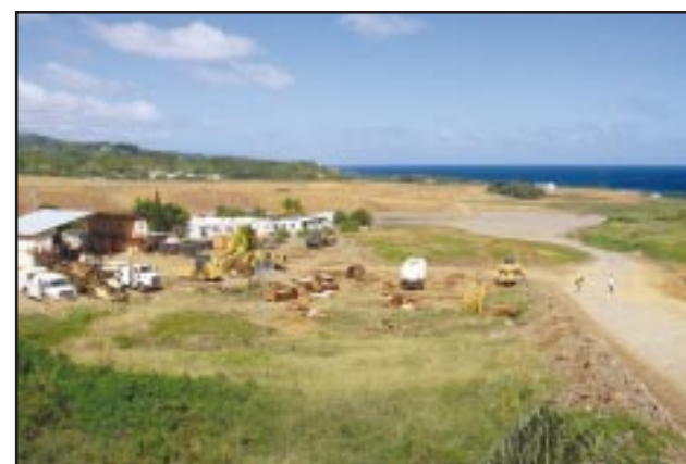
Lands being cleared in preparation for the construction of the terminal buildings and other landside facilities