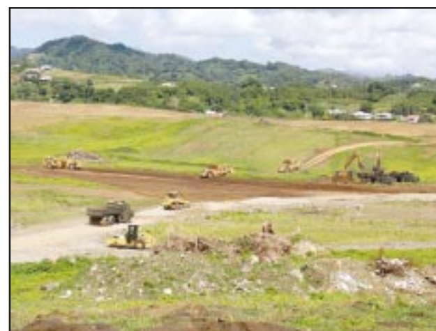
Extension of Earthworks into the 2nd kilometer of the project (October)