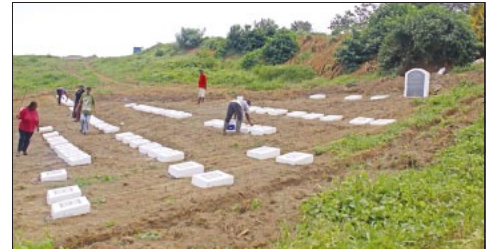
New cemetery at Peruvian Vale (October)