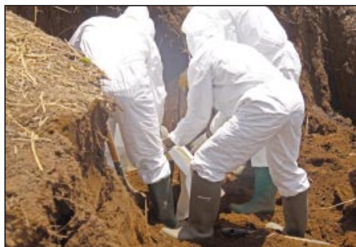
Grave diggers removing remains from the cemetery at Argyle (September)