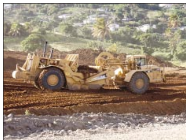
One of two additional Motor Scrapers that arrived in October