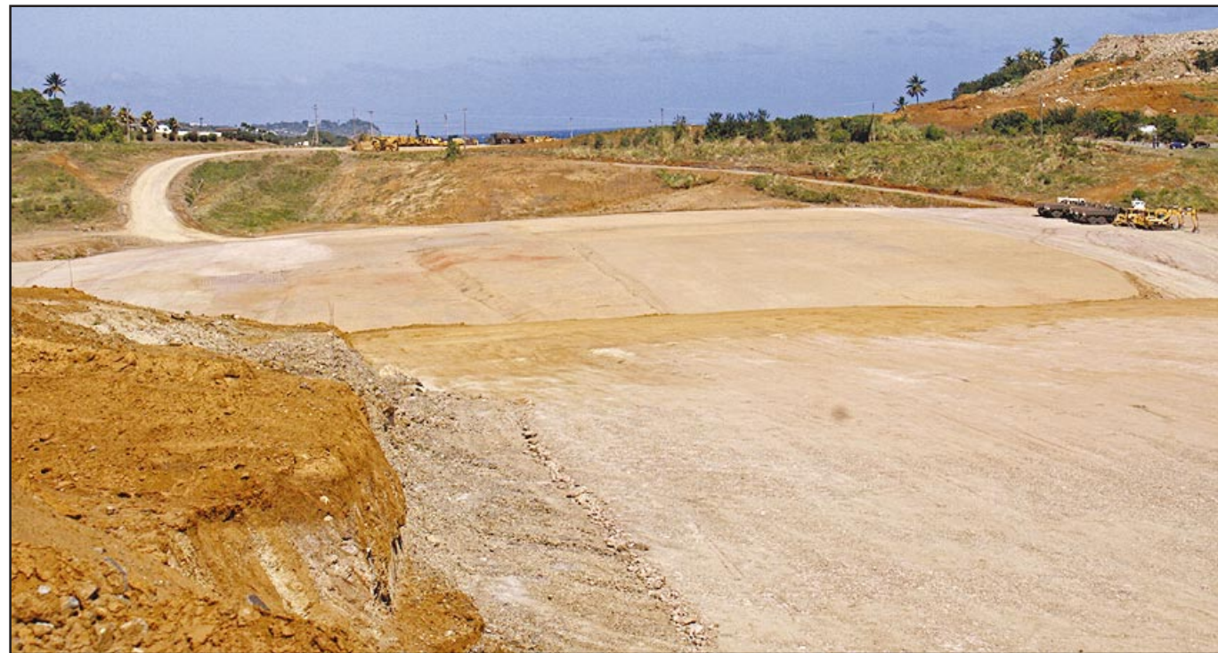
A spectacular view of the runway in the 1st kilometer (December)