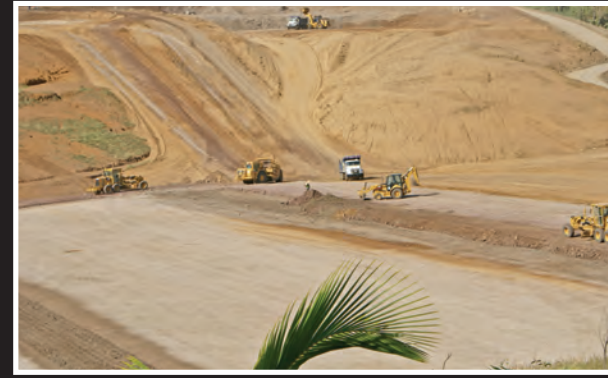
APRIL 2009: Progress being made in the 1st kilometer as workers move towards the required height for the runway.