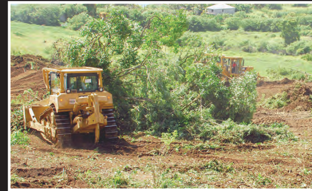
AUGUST 2008: Day one of the start of the earthworks.