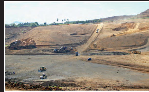
CUTS AND FILLS continue in the 1st kilometer.