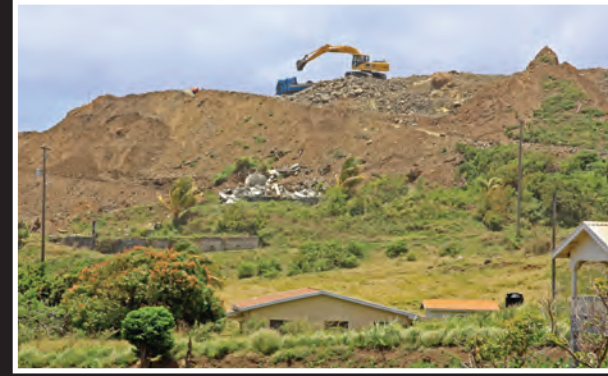
THE EARLY removal of soft rocks from McConnie Yammie Hill.