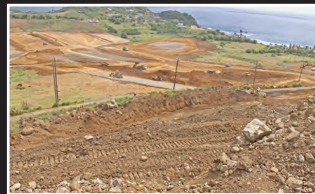
THE START of cuts and fills in the 1st kilometer in preparation for the construction of the runway.