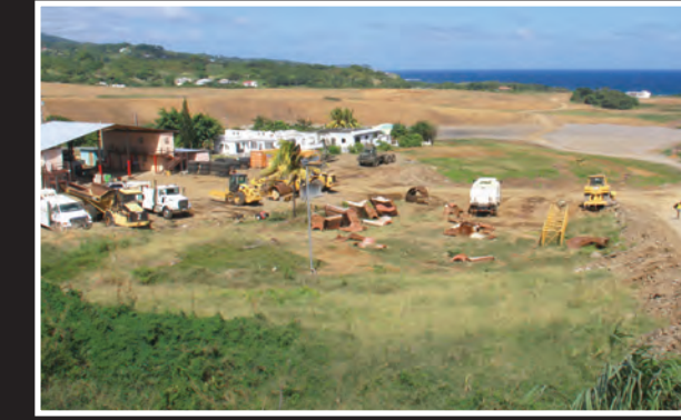
EARTHWORKS extended into the 2nd kilometer.