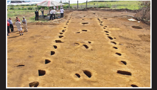
POST HOLES discovered at the largest archaeological site in SVG.