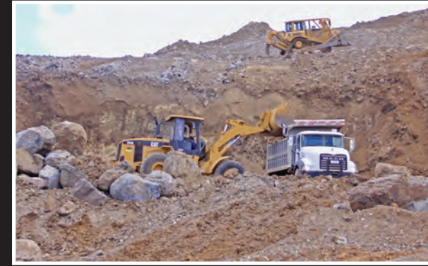
MORE ROCKS being removed from McConnie Yammie Hill.