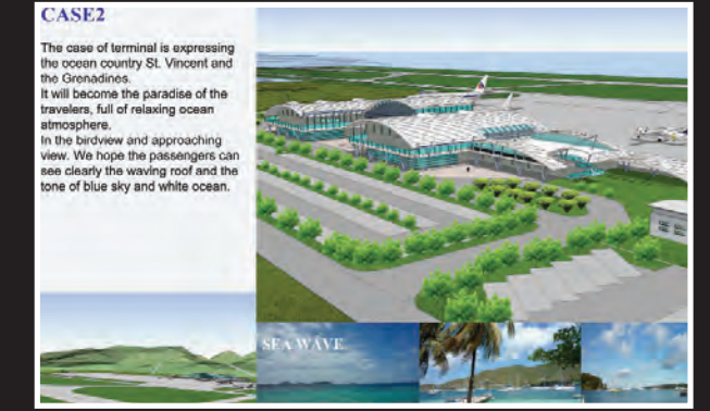
CASE2 The case of terminal is expressing the ocean country St. Vincent and the Grenadines. It will become the paradise of the travelers, full of relaxing power atmosphere. In the birdview and approaching view. We hope the passengers can see clearly the waving roof and the tone of blue sky and white ocean. PRELIMINARY DESIGN for the terminal building.