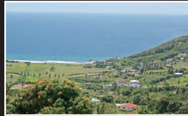
ARGYLE BEFORE the airport project.