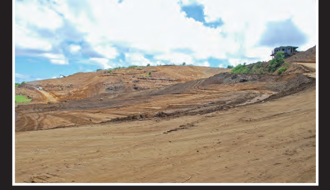
EARLY STAGES of earthworks in the 1st kilometer.