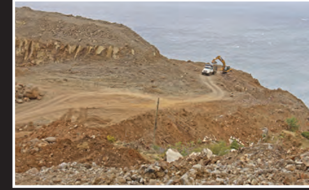
EARTHWORKS being carried out on Fort Hill.