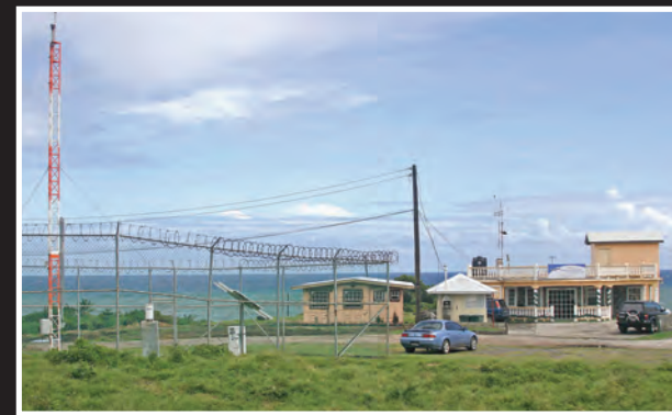
ONE OF THREE wind stations at Argyle.