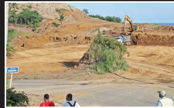
JOHNSON HILL being removed in the first kilometer.