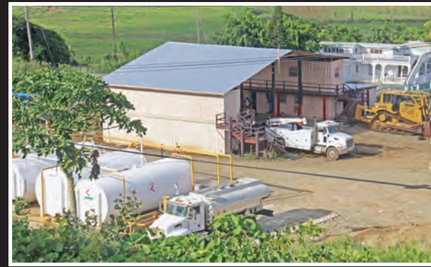
WORKSHOP and fuel station on site at Argyle.