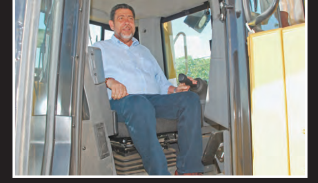
PRIME MINISTER Dr. Ralph Gonsalves seated in a bulldozer as he prepares to demolish a building.