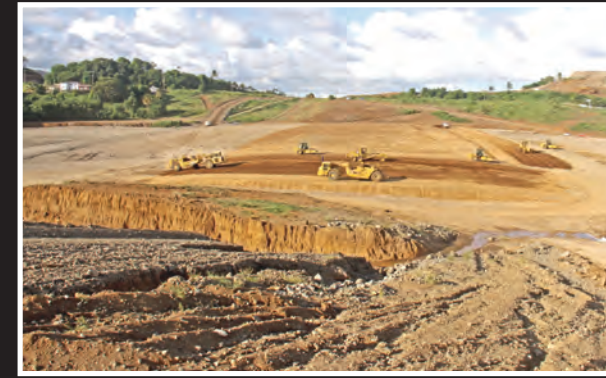
TRENCHES being dug in preparation for the installation of culverts. Here you can also see the runway beginning to take shape.