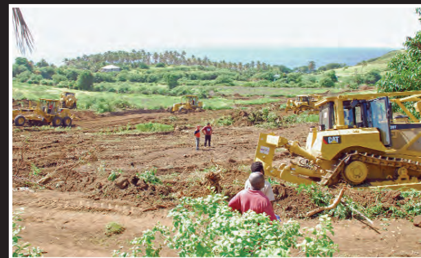
DAY ONE of the start of the earthworks.