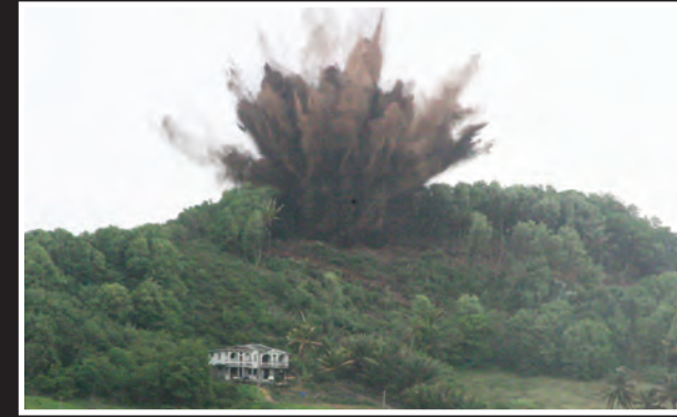
JULY 2008: Symbolic start of construction.

Work on the construction of the Argyle International Airport commenced on August 13, 2008. Up to mid December major strides have been made as can be seen in these photos.